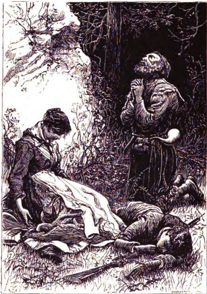
ROGER MARVIN'S BURIAL. See page 138